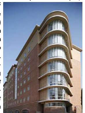
The Spelman Suites - a silver rated LEED certified building.

Smart Electrical Grids and Buildings. In the United States, the electrification, lighting, heating and cooling of buildings accounts for around 40 percent of all CO2 emissions. Although efforts to create more sustainable buildings are under way—for example, new construction both the University of California, San Diego (UCSD) and the University of California, Irvine (UCI) will be Silver or Gold Leadership in Energy and Environmental Design (LEED) certified - increased attention to design alone will not be sufficient. Rather, what is needed is the deployment of embedded sensors providing better real-time energy management so that the building occupants can adjust their behavior, and so that smart autonomous management systems can be created to decrease lighting, power, and cooling demands.